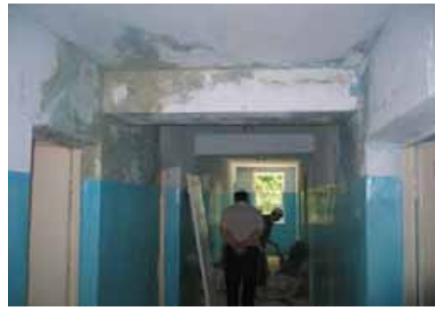
Intern look of the dormitory before repair