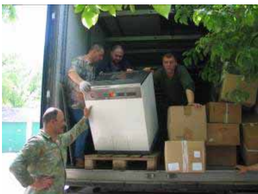
The donated washing machine is foreseen for the new children center of family type in Cojusna