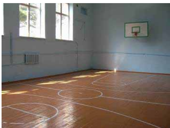
The sport hall today