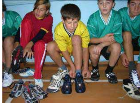
The children from the middle school in Grigorauca are glad because of the donated sport shoes by ADIDAS – SALOMON AG

In October 2005 PRO UMANITAS received as humanitarian aid the truck Mercedes 814 L from "Pro Moldavia e.V.", Organisation, Germany as well as a great quantity of lamps which were installed within the boarding-school in Straseni. The received truck will be used by PRO UMANITAS for transporting humanitarian aid and within the projects which foreseen repair works for the boarding – school in Straseni.