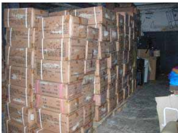
The new cloth was donated by "VIVA WESTFALEN HILFT E.V.", Germany and it was distributed through 21 organisations for 4930 people