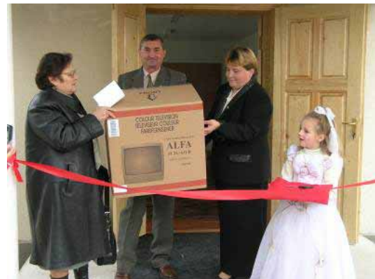
official opening of the center