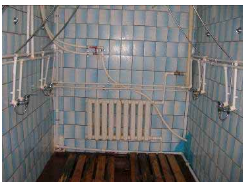
The repair works have been done with quality