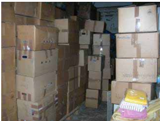
As always the received humanitarian aid from "Hilfe fuer Osteuropa e.V." is well stocked and well packed