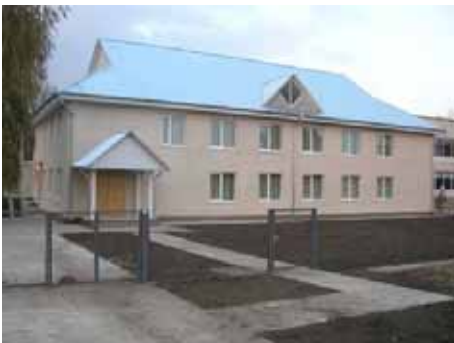
... after repair

The children will have the possibility to develop their abilities in music, foreign language study, computer.