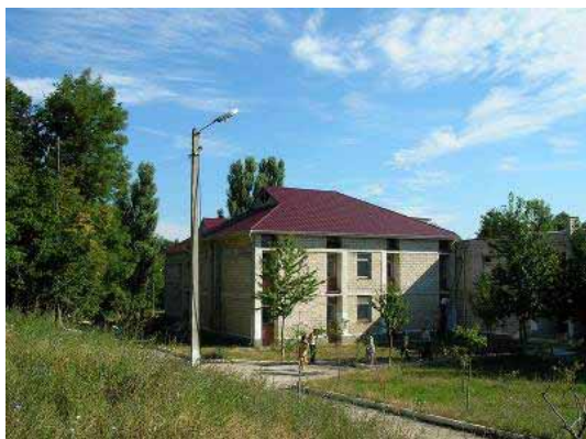
So looks now the new roof