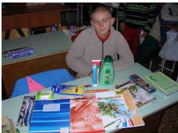
The content of the parcel brought joy to children

The goods through 21 nongovernmental organisations were distributed to the boarding – school for mental handicapped children in Straseni, to the orphanage with blind children in Bălți city, to the kindergarten from Grigorauca village and to other institutions.