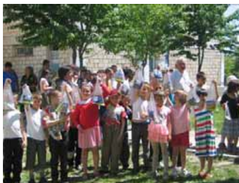
Children' joy during the international children day