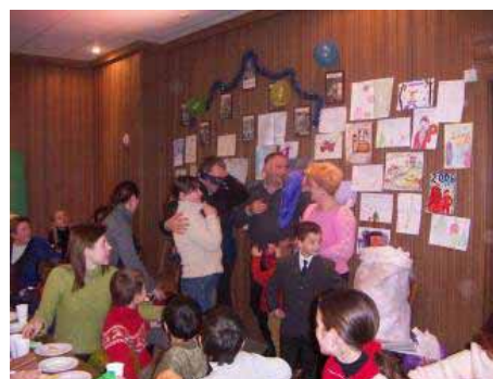
This day will remain for a long time in the children' memory