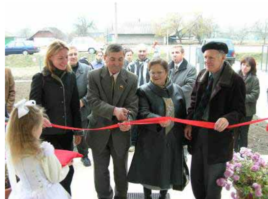
the so long waited goal is achieved