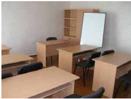
here there are held the theoretical lessons for sewing