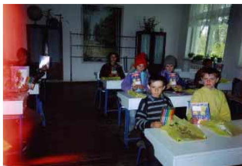
School supplies for children from the average school in Gangura