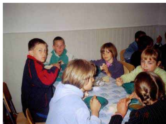
The soup kitchen in Grigorauca

warm meals to 33 elder people, 19 sick people, 80 children, 13 orphan children from Stauceni.