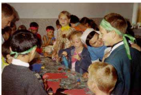
Handicraft workshop for children within the summer camp