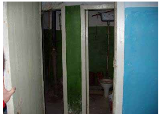
Sanitary links before repair works

district has also financially contributed, in particular paying partial for the building materials.