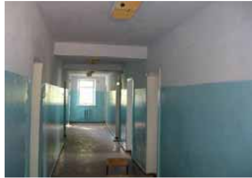
Intern state of the dormitory after repair