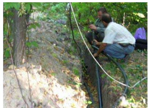
Installation of the water pipes

The appropriate water source was built 800 m far from the boarding-school's building and the water running has been connected to it. The water runs to the dormitories and as a result, the children will have daily water.