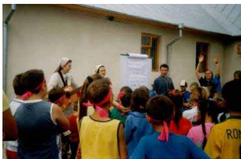
Contests within the summer camp's program