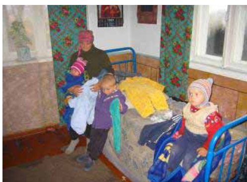
support for the large family in Grigorauca

A large and poor family from Grigorauca village was supported in order to buy the needed medicine for the children.