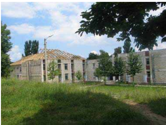
Installment of the new roofs on 2 dormitories

Due to the participation of the Austrian Agency for Development and Hilfswerk Austria there was installed new roof on 2 dormitories of the boarding-school. It was urgent to install because the water after rain was running direct in the dormitories and it made the walls wet. Simultaneous, the Council of Straseni district paid for the installment of the new roof on the school within the boarding-school.