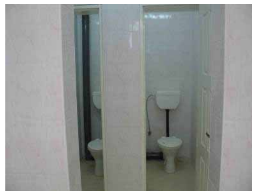
sanitary links after repair

In the nearest future there is foreseen the repair of the sanitary links within the 2nd dormitory with the financial support of the same German donor.