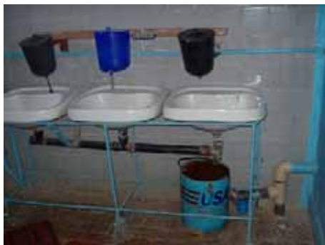
before repair works

The boarding – school in Straseneni faced great problems in 2005: the bad condition of the roof, no water system which since the last 15 years has not been working, destroyed sanitary links within the bathrooms and toilets of 2 dormitories of the children, bad water running within the soup kitchen and laundry.