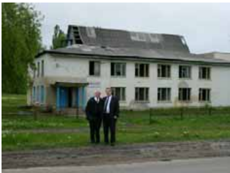
the professional training center in Grigorauca before

The center trains the young people and it makes possible for them after graduating the school and being without any available financial means to learn a profession. To note the following training courses within the center like being the agricultural field, mechanics, radio, sewing classes, foreign language study, computer classes, hairdo workshop.