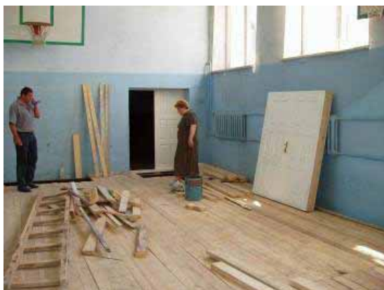
Installation of the new floor