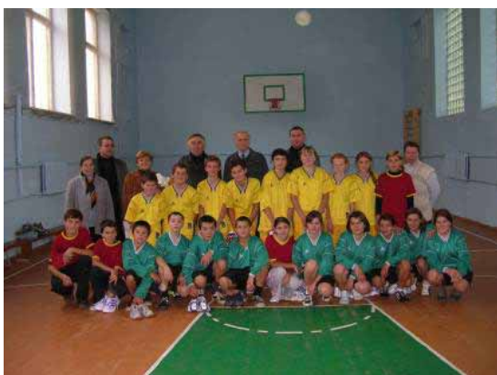
The new sport cloths and sport shoes bring a lot of joy to children

Due to the donated sport cloths and sport shoes the pupils will be able to participate within different regional contests.