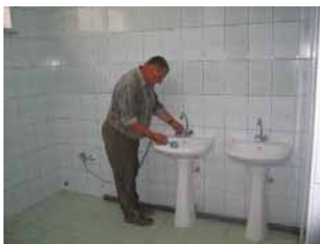
after repair works