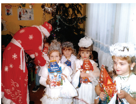
The Christmas sweets brought a great joy to children

In all, within this charitable action 671 children and 523 adults were beneficiaries who enjoyed Christmas Holidays being sure that there are people living abroad who think about their difficulties and helping with a good word and concrete actions.