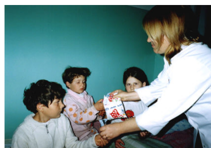
Children from the tuberculosis hospital receive milk products

Today the hospital receives from the state mainly foods for children and no milk products which have vital importance for their treatment. In this concern, the Organisation "Ost West Arbeitskreis e.V." from Bochum city, Germany financially participated to provide children with milk products and the volunteers of PRO UMANITAS distributed directly the milk products to the children from the hospital.