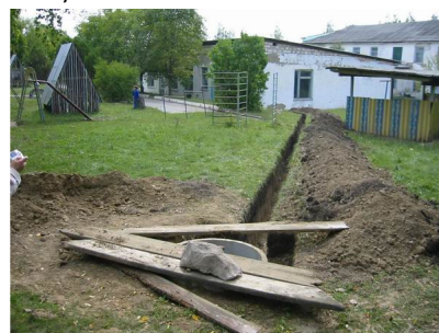
Several days yet and the children from the kindergarten in Grigorauca village will have water from the deep well which is being built

These projects were developed due to the financial participation of the Association "Les enfants d'Edinet" from France, charity Organization "Hilfe fur Osteuropa e. V", Todtnau city, Germany and Organization "Ost West Arbeitskreis e.V" from Bochum city, Germany.