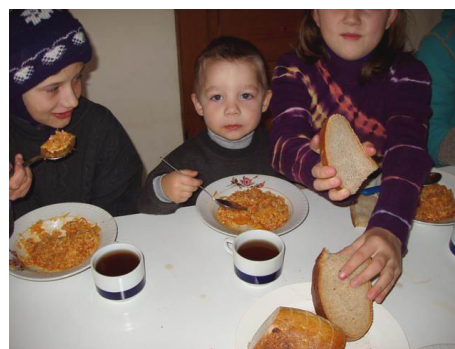
Children during the warm meals within the soup kitchen in Stauceni village

In January 2004 within the Catholic Parish from Stauceni village there was started the development of the project "Warm meals for street children and children from poor families within the soup kitchen". The project is foreseen for 1 year with the financial participation of "Doris Eppele Stiftung", Oehningen-Wangen, Germany. Within this project, 40 children benefited warm meals 6 times per week. These children have been selected as beneficiaries of the project because they don't have permanent nourishment at home which strengthens the children's development and it facilitates the study process. To note that a special contribution is given by Father Klaus who is the Prior of the local Parish.