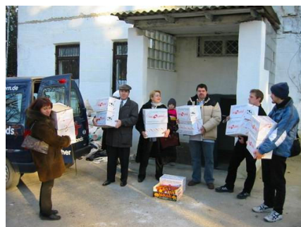
After several moments the children from the tuberculosis hospital will receive Christmas gifts