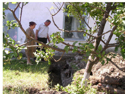
The kindergarten's Director from Grigorauca village and the leader of the building company check up the quality of the building works of the water drain

sanitary technics for bathroom and toilet and needed technics for providing automatically the kindergarten with water.